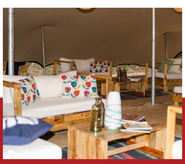
Opposite and 1 - Exclusive lounge and dining area with staging for Rugby Panel Discussions and large screen for Rugby game viewing. 2 - Cash Bar 3 - Tea, coffee and rusks included. 4 - Cosy fireside seating with knee blankets 5 - Chill-out lounge